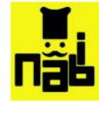
National Association of Bakery Industry